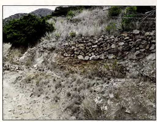
Fig. 2. Larval habitat of Rhynchina canariensis : slopes with partially open ground in Vallehermoso (La Gomera, December 2011).

excessive moisture at room temperatures (18–20°C), and taxonomic identifications were confirmed after they attained the imaginal stage.